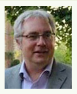
Loomis Distinguished Lecturer

Loomis Distinguished Lecture & Plant Biology Mini-Symposium Interdepartmental Plant Biology Graduate Program